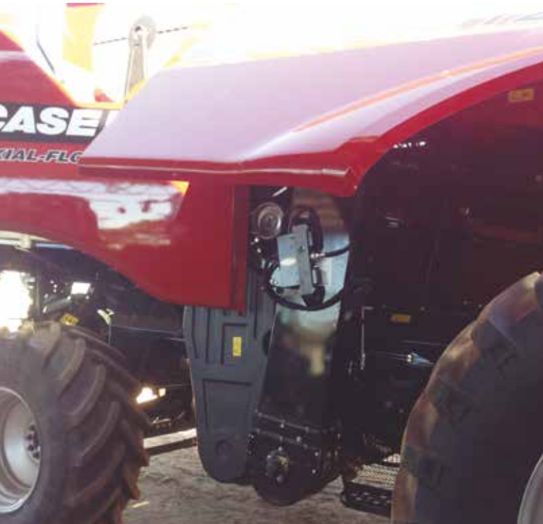
CropScan 3000H remote sampling head mounted to a Case combine.

The experiences of farmers across Australia are varied. In some